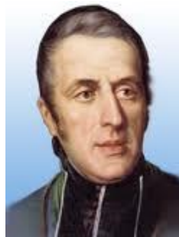
Homily instructions in Provencal, given at the church of the Magdalene in 1813 [March 3, Ash Wednesday].

conversatio vestra in caelo (Phil. 3:20), let your eyes see for once beneath the rags that cover you, there is within you an immortal soul made in the image of God whom it is destined to possess one day, a soul ransomed at the price of the blood of Jesus Christ, more precious in the eyes of God than all earth's riches, than all the kingdoms of the earth, a soul of which he is more jealous than of the government of the entire universe."