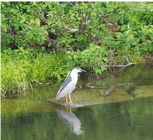
Heron in contemplation Heather Duggan