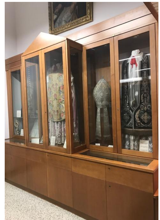
The coat worn by St. Eugene de Mazenod at the time the photo of him was taken (framed in the background).