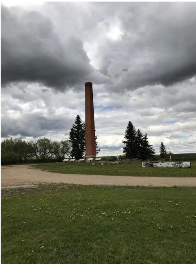
A reminder still stands of the St. Charles Scholasticate – the “Home on the Hill” after it burned down in 2003.