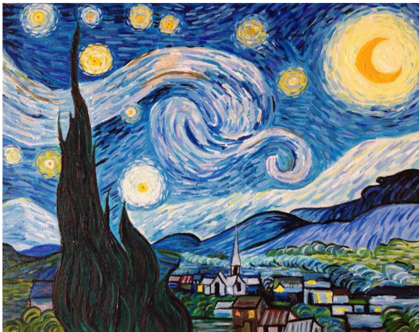
Vincent Van Gogh “Starry Night”

Our identity as pilgrims call is to “achieve unity in out life only in and through Jesus Christ” (C31). Our Constitutions and Rules set out a privileged means for each Oblate to follow in the footsteps of Jesus Christ and to allow each Oblate to evaluate the quality of his response to his vocation and to become a saint (C163)