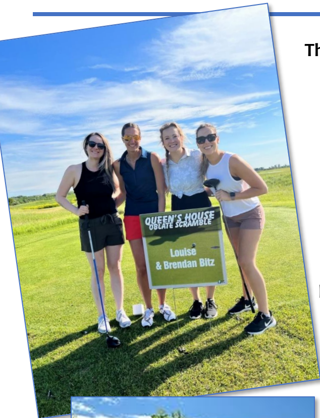
The Bitz Women in action!