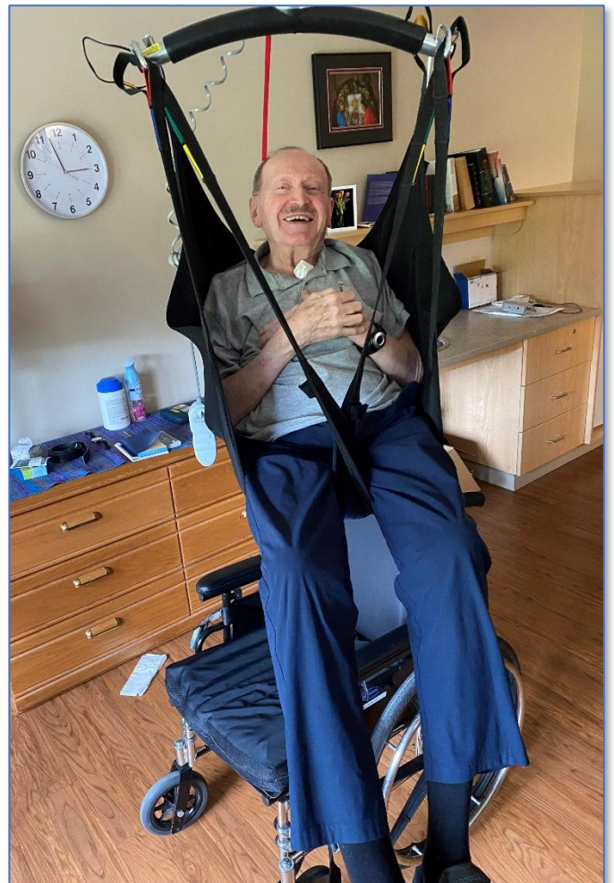
Our very own Flying Priest is all smiles!