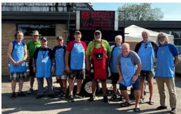
Knights of Columbus contributed their cooking skills!