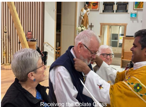
Receiving the Oblate Cross