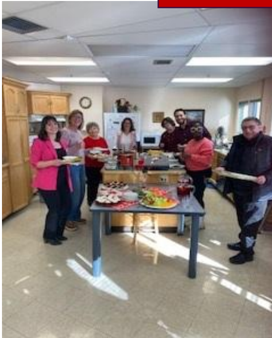
Oblates & Parish Staff share a Valentine's Lunch

All are welcome to subscribe for the Star Gazer Newsletter