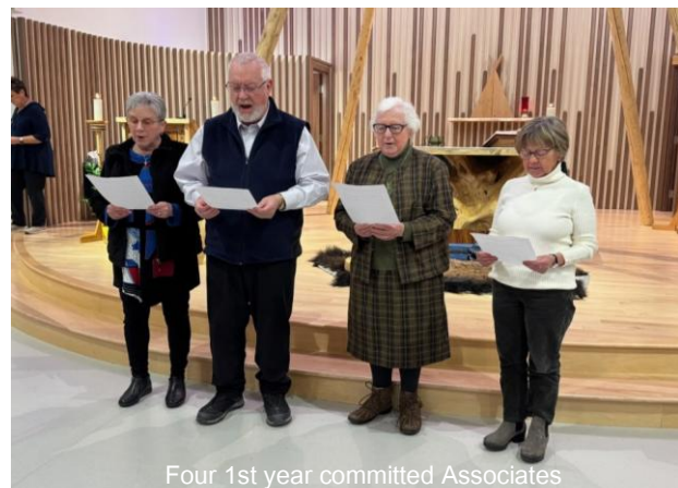
Four 1st year committed Associates