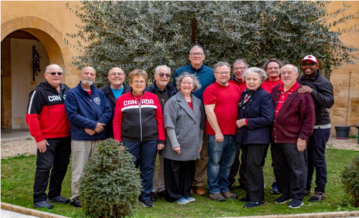
Canadian Pilgrims in the inner courtyard of the Oblate house.

From March 9–19, 2026 , twelve pilgrims from across Canada made their way to Aix-en-Provence to follow in the footsteps of St. Eugene de Mazenod , founder of the Oblates of Mary Immaculate, and to deepen their understanding of his charism.